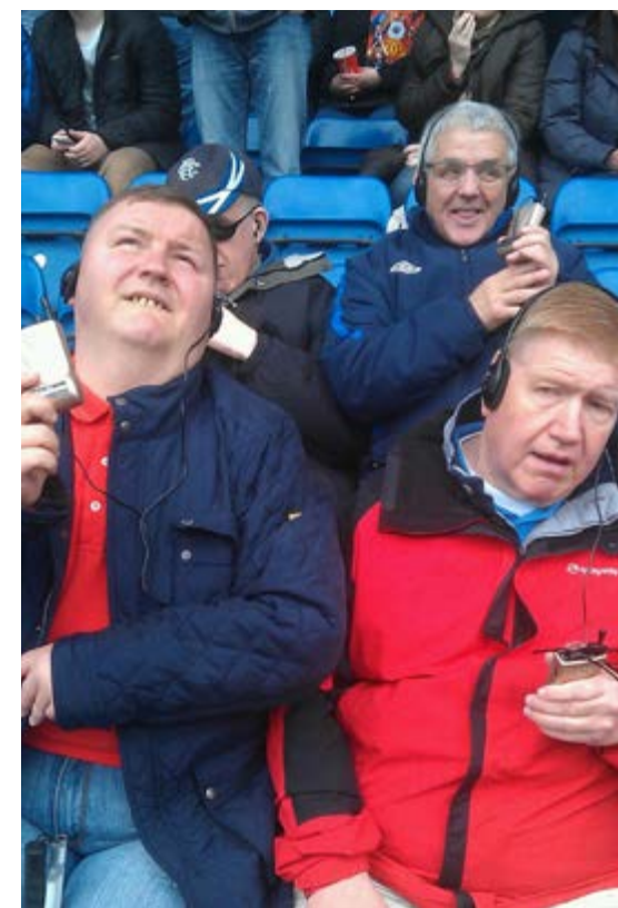
RANGERS REX - Blind party supporters audio system